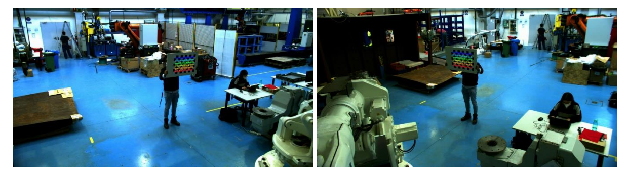
Figura 1. Images of the stereo calibration process.

One of the essential steps in order to be able to compute 3D positions from stereo vision systems, is to previously calibrate the stereo pair. This calibration involves the intrinsic calibration of each camera and the stereo calibration of both in order to know the transformation between the two cameras (relative position).