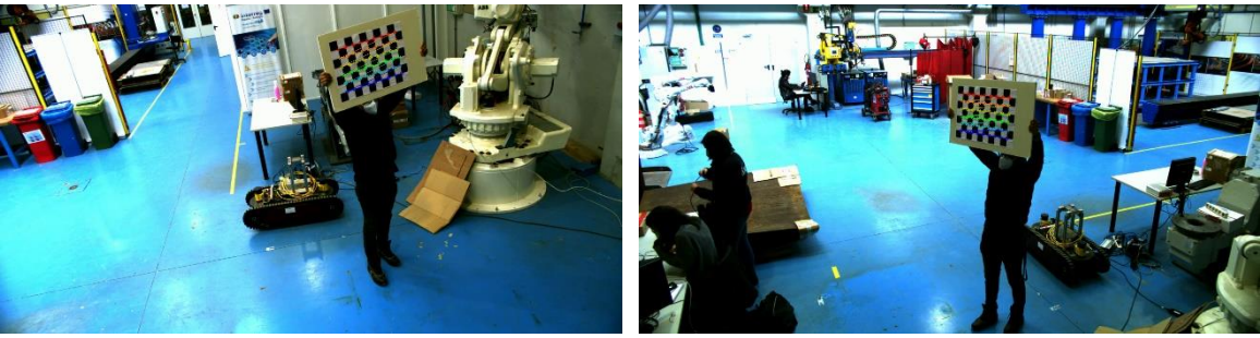
Figure 2. Example of images captured for stereo calibration.